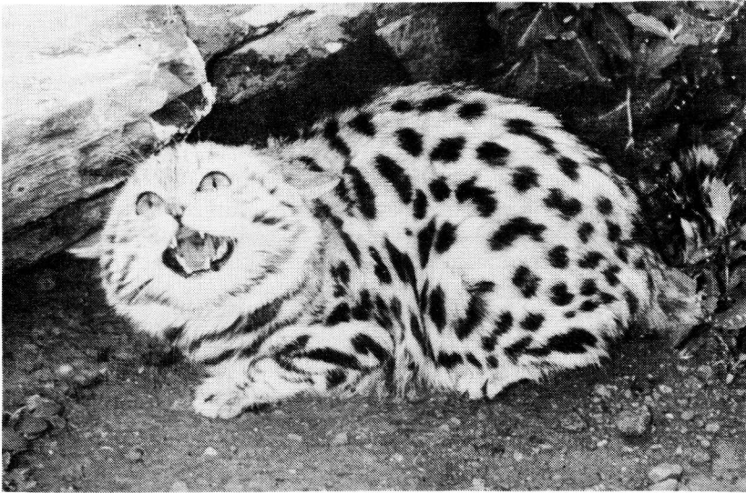
The small-spotted cat, Felis nigripes .

The most interesting range extension is of two specimens killed on the farm "Rietvlei" (3320 CC Montagu, 33°45'S; 20°11'E) in the South West Cape. As can be seen from the map this extends this carnivores known range by some 450 km. Unconfirmed reports of the small-spotted cat occurring in several areas of the Calvinia and Ceres districts now become more feasible.